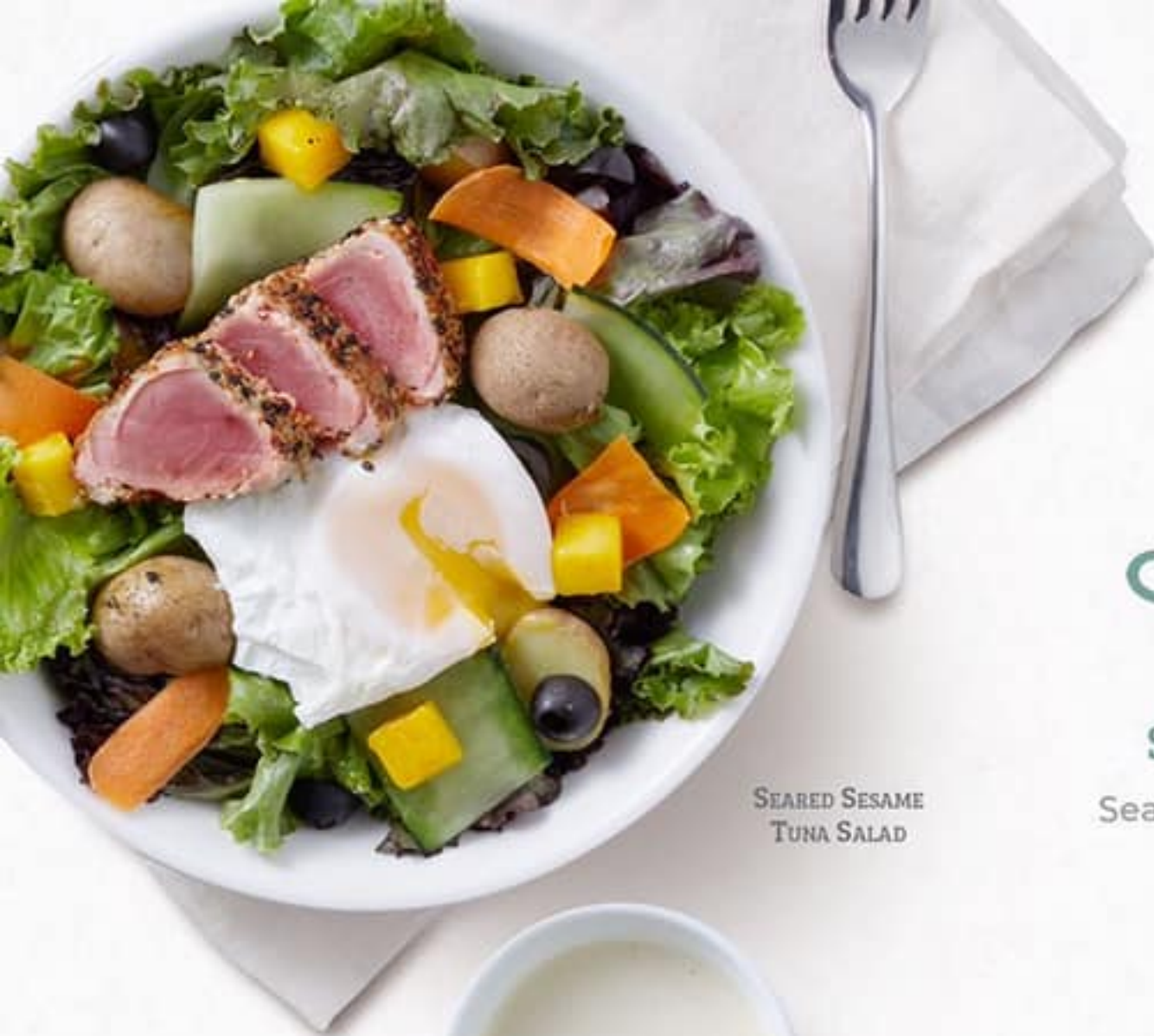
SEARED SESAME TUNA SALAD