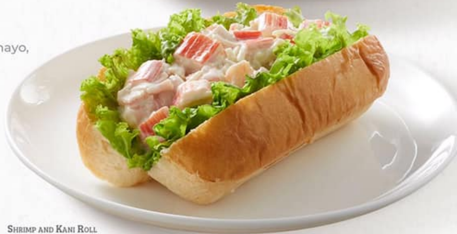
SHRIMP AND KANI ROLL