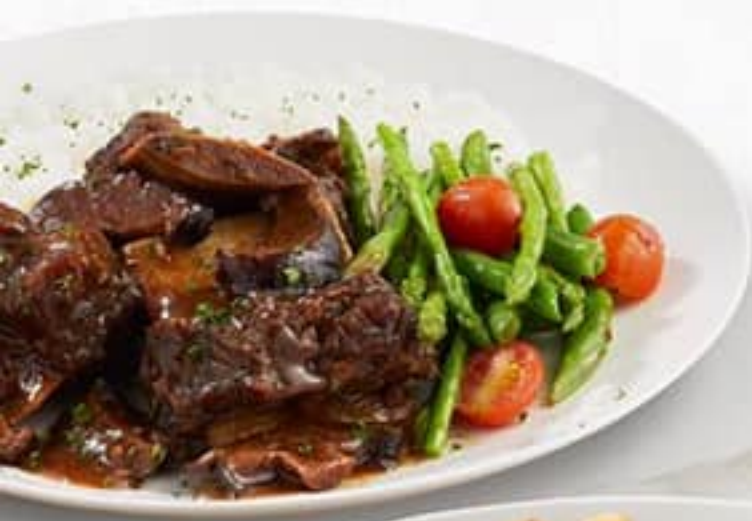
BRAISED BEEF SHORTRIBS