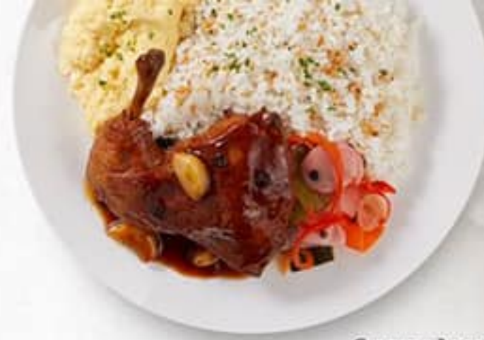
CHICKEN ADOBO CONFIT