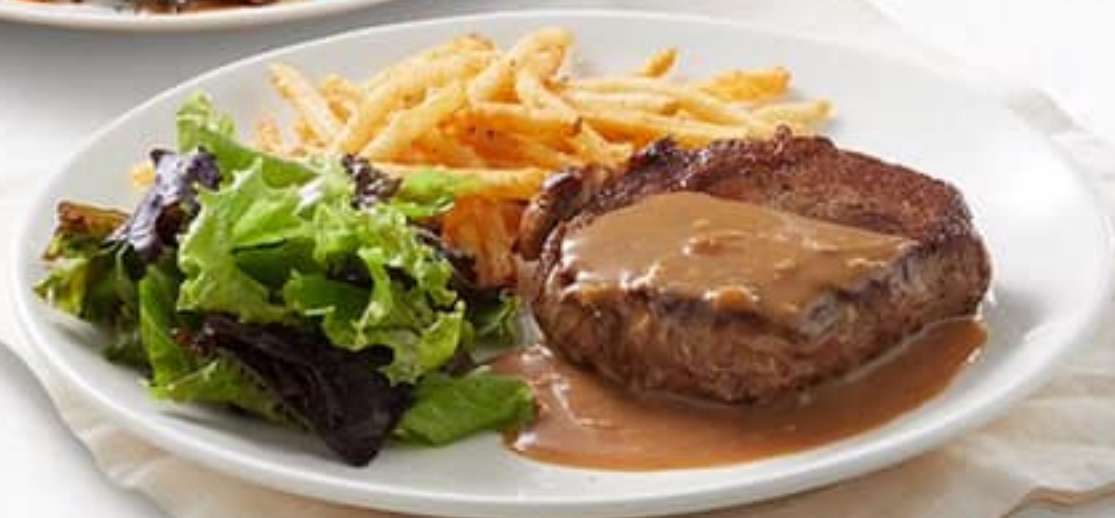
STEAK AND FRIES