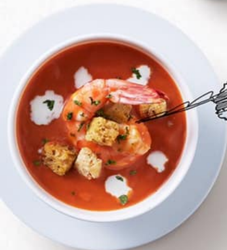
PRAWN BISQUE SOUP