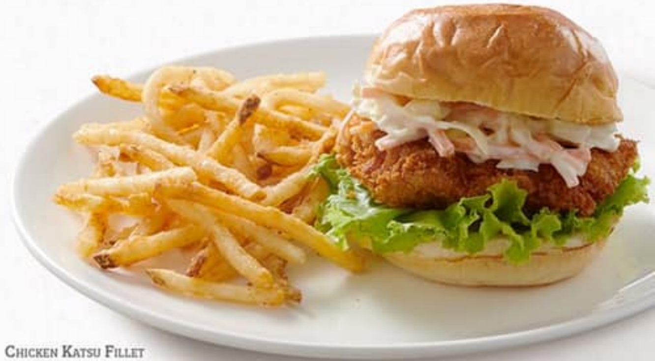
CHICKEN KATSU FILLET