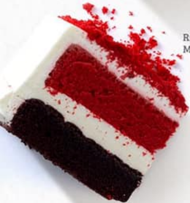
RED VELVET MOUSSE CAKE